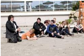
The MicroArts Creative team meets on the beach before work recently. The Greenland-based company sees an opportunity helping other firms use social marketing.

For more information go to www.doyouFINT.com , www.facebook.com , www.linkedin.com , http://twitter.com , and www.microarts.com .